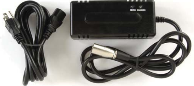
Due to continuous improvements to our products, product images may vary slightly from depiction.